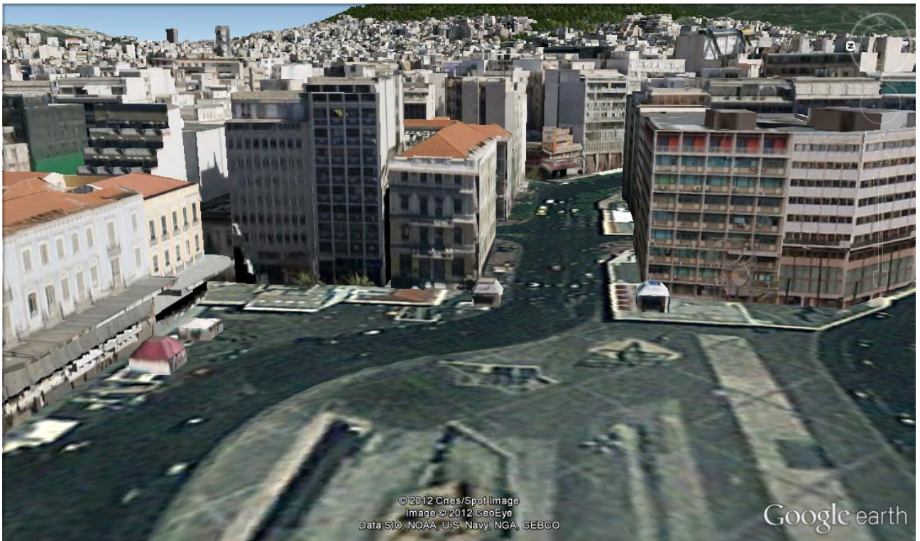
B. Omonoia square