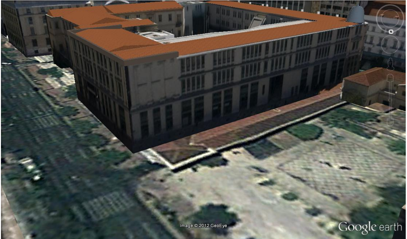
C. Dikaiosynis Square