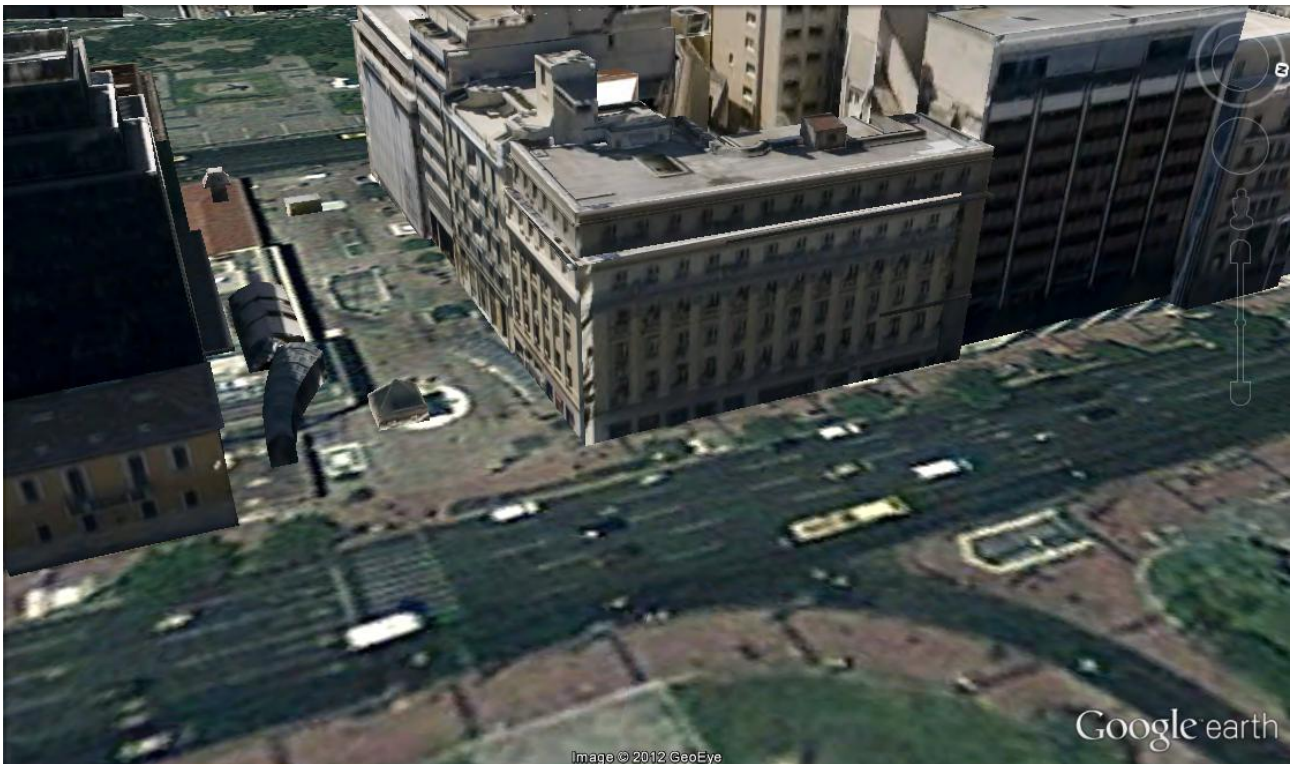
D. Korai and Panepistimiou Street